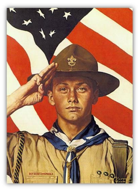
NORMAN ROCKWELL 1944

Can you recreate a Norman Rockwell picture?